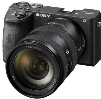
α 6600 with SEL1655G

At the heart of both the new α 6600 and α 6100 sits a 24.2MP 1 Exmor™ CMOS image sensor, the latest BIONZ X™ image processor and a front-end LSI implemented in Sony's full-frame cameras. This powerful trio combine to deliver all-round enhancements in image quality and performance across all areas of photo and video capture.