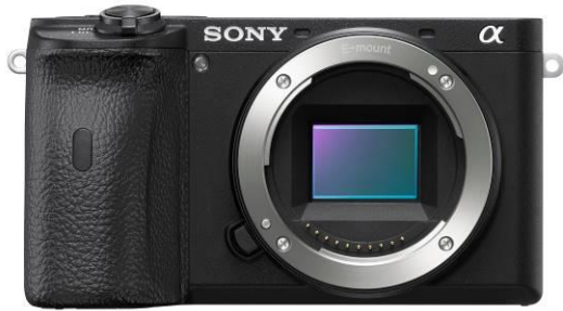
α 6600 in Black