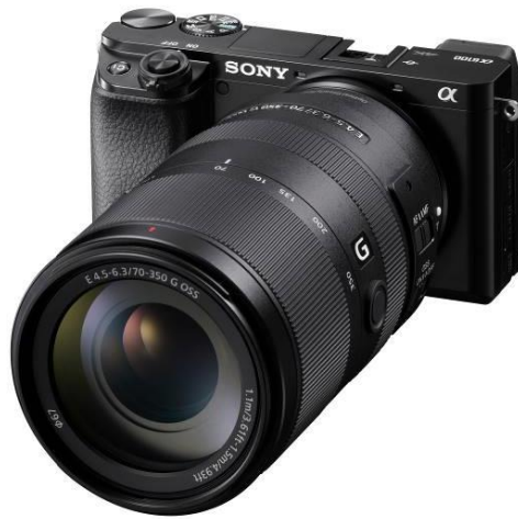
alpha 6100 with SEL70350G