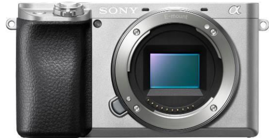
α 6100 in Silver