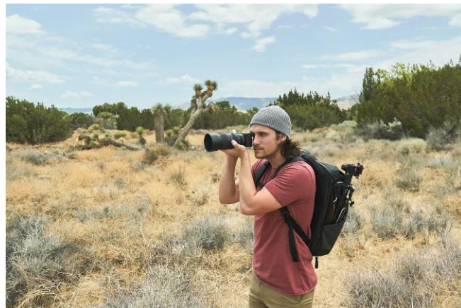
α 6600 with SEL70350G

At the heart of both the new α 6600 and α 6100 sits a 24.2MP 1 Exmor™ CMOS image sensor, the latest BIONZ X™ image processor and a front-end LSI implemented in Sony's full-frame cameras. This powerful trio combine to deliver all-round enhancements in image quality and performance across all areas of photo and video capture.